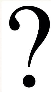
What was the Puzzle

Guessed and Checked Drew a Picture or Graph Made a List or Table Looked for a Pattern Made a Model Tried all possibilities